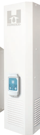
DVS-HW HIGH CRAWLSPACE UNIT