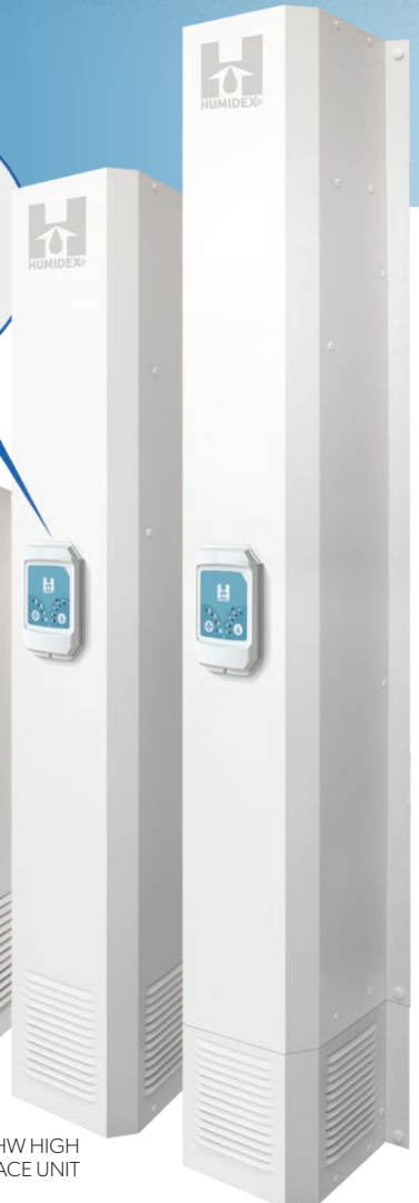
DVS-BS STANDARD BASEMENT UNIT