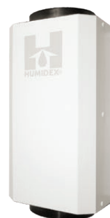
DVS-CS CRAWLSPACE UNIT (available with Booster fan)